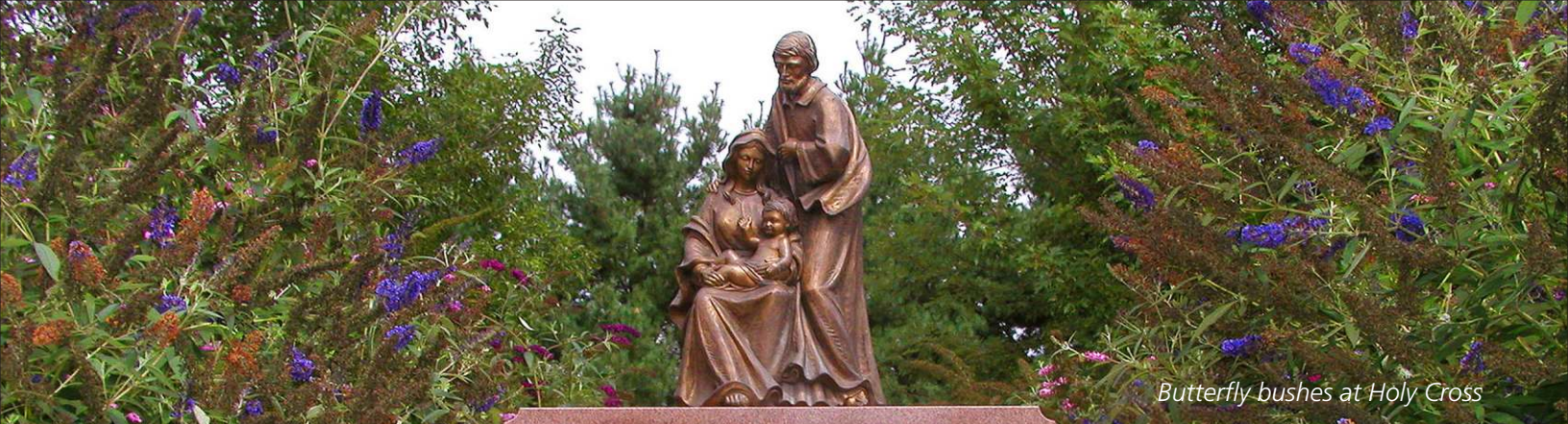
Butterfly bushes at Holy Cross