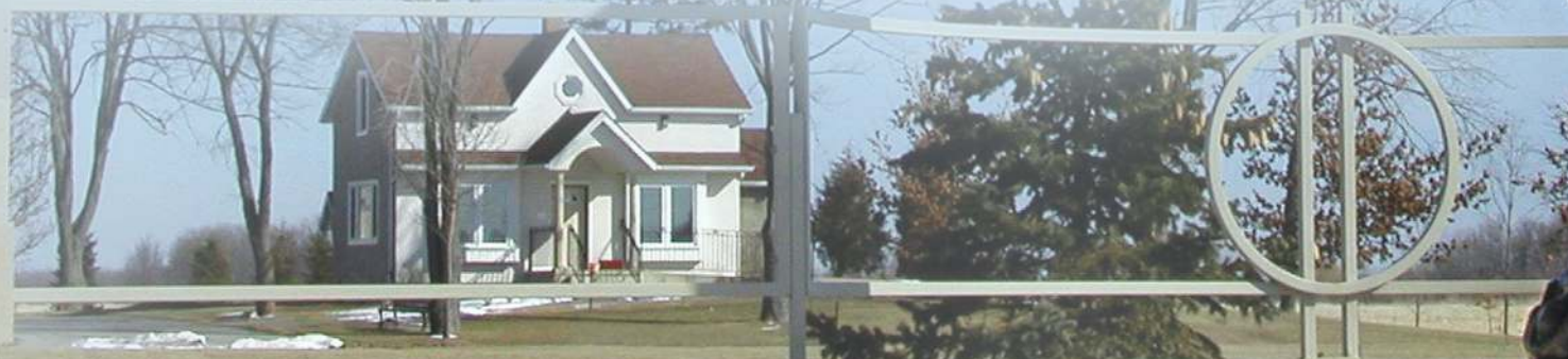
Our Lady of the Angels Catholic Cemetery.