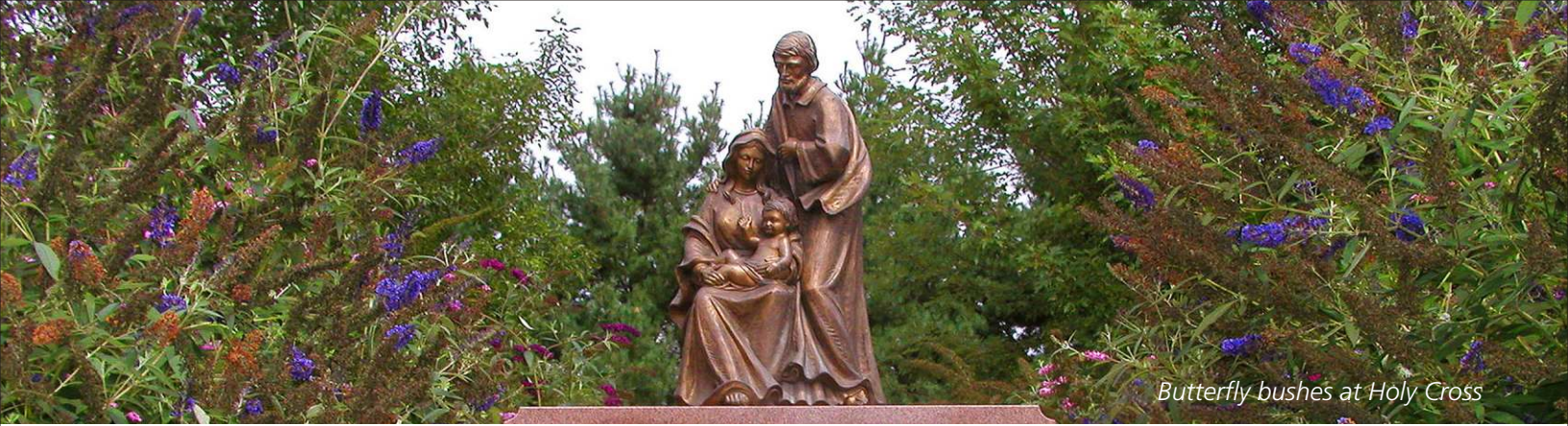
Butterfly bushes at Holy Cross