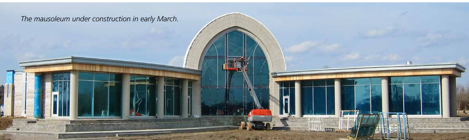
The mausoleum under construction in early March.

"People think everyone has to be Catholic to go there, but it's like being enveloped in a big hug, and we feel we belong."