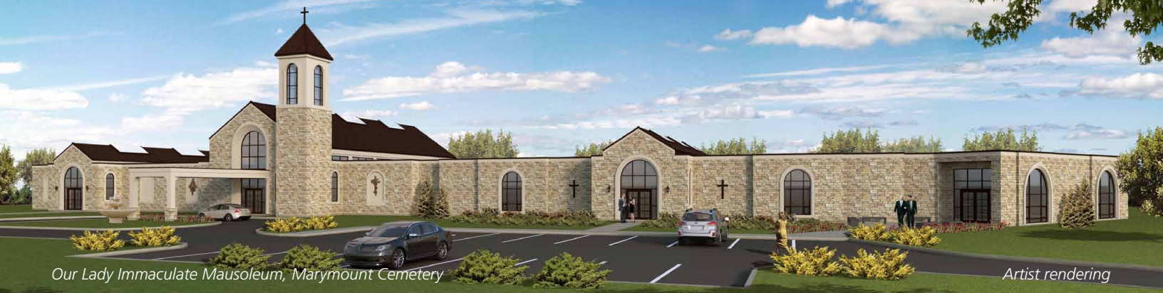
Our Lady Immaculate Mausoleum, Marymount Cemetery